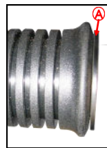
Ⓐ Plastic Thrust Washer