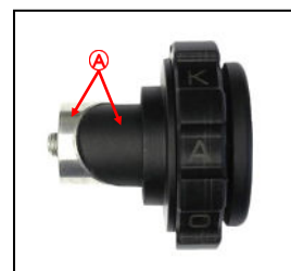
Ⓐ Spigot and Wedge Nut

DISCLAIMER: NO RESPONSIBILITY ACCEPTED FOR NON-ADHERENCE TO THESE INSTRUCTIONS