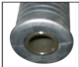
OEM bar-end plug removed